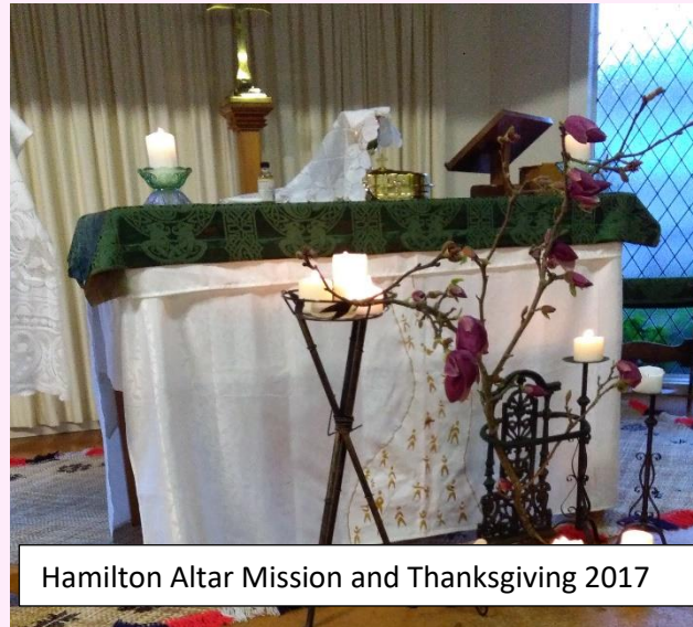
Hamilton Altar Mission and Thanksgiving 2017

A leading, early SCIENTIST told the people to look at a burning candle, which is made up of