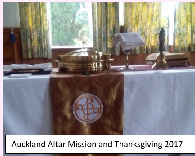
Auckland Altar Mission and Thanksgiving 2017