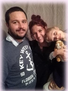
Dit is my kontrei